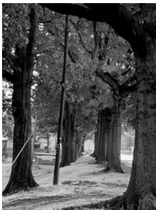
Trees at the Hamburg Community Park

These sentinels resemble time travelers, connecting the past with the present, reminding us of our enduring travel through time.