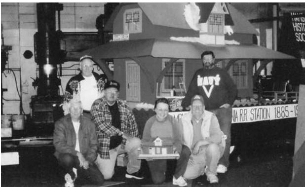
Reprint of Mystery Photo from the Summer Issue

As the float banner says, that historic station stood by the tracks from 1885 to 1968. Many people now say they wish it had been preserved, but in the 1960s it stood empty and much deteriorated, no funds available to save it. During WWII it was a USO center, and for a time a family lived in an apartment upstairs, and there also had been a restaurant in the building. Had there been a Hamburg Area Historical Society in 1968, that building might have been saved.