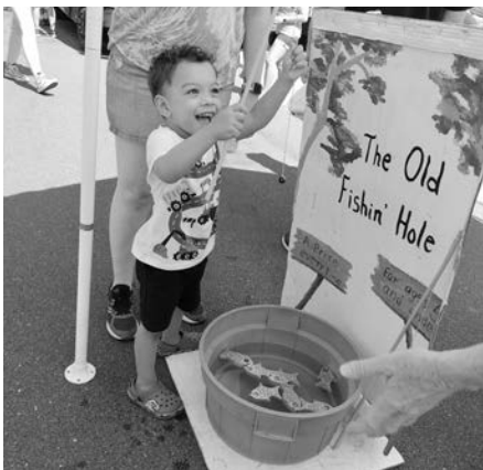
A Little Fisherman

At the end of the day there is the valiant crew – bless them! – that packs everything up, takes down the canopies and tables, and puts it all away. A percentage of our income that day is given to Our Town Foundation, which does a fantastic job of planning and managing this festival. This is one of our main fundraisers. Thank you to everyone who pitched in to help.