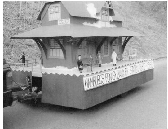
Above are two other views of the 2003 float