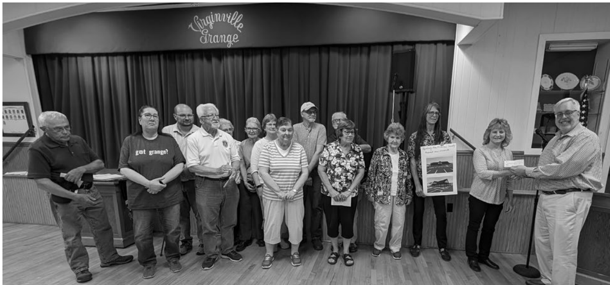
Our members and officers receive a check from the Virginville Grange

On May 1, some of our officers and members attended the meeting of the Virginville Grange, where we were given a check from that organization for $1,500. They praised our efforts in preserving local history, an endeavor that they share as well.