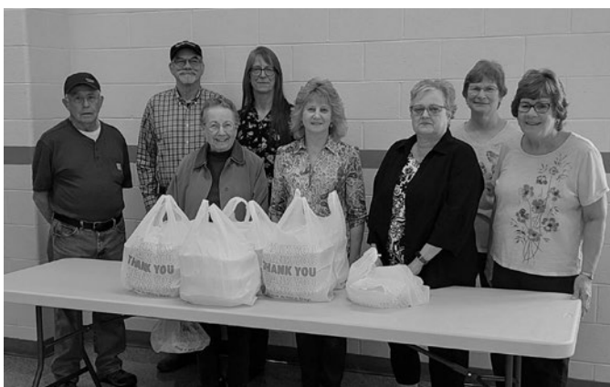
Another successful BBQ

Donations of jewelry etc., and mugs and stuffed animals are appreciated throughout the year. Call 610-562-5904. Also, volunteers are needed for the set-up and take-down crews, as well as tending the stands. Call an officer or board member, or the phone at our Historical Society house at 610-562-3664. Can you donate an hour or two of your time for one of our biggest fund-raising efforts? This is an important fund-raiser for us each year, and our crews of helpers are the stars of the show! Our stand is near to a very good music stage, so we enjoy that as well.